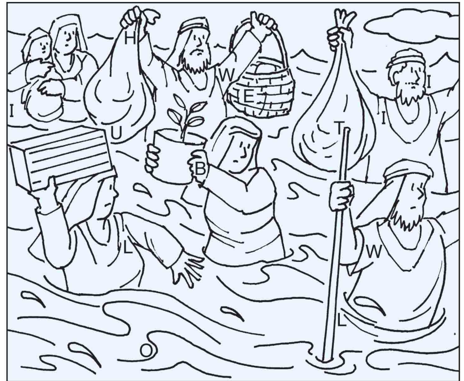
Westminster Presbyterian Church Dallas, Texas

Find each of the letters in God’s promise hidden in the scene below. I WILL BE WITH YOU